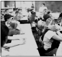
Grade school students studying with the design process