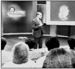
Business training session at Franklin